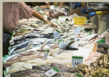
SECRET SPOT MERCADO DEL CARMEN 'This fish market restaurant in El Perchel is owned by a family of fishmongers and is a 30-minute walk from the old town but you get the best fried fish here.'