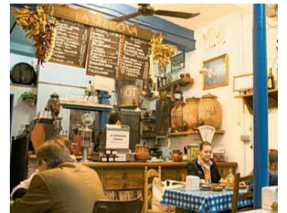
Café culture: Take your pick