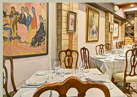
TAPAS FOR FOODIES MIGUEL 'Miguel is by the bullring and only has a few tables. I love the roast lamb and piglet, cuts of prime beef, amazing cod.' restaurantemiguel.es