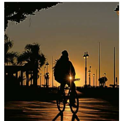
On yer bike: A hip Málagaños cyclist