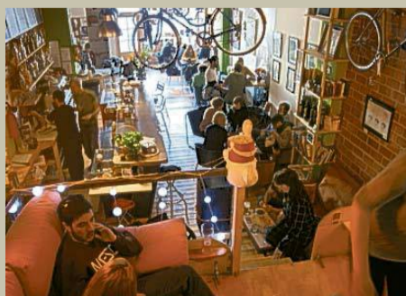
BEST NEW CAFE RECYCLO BIKE CAFE 'It's next to the central Málaga market (Atarazanas) but it feels like stepping into a café in Berlin or London. Good music, fine coffee'. recyclobikeshop.es