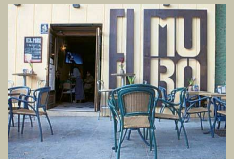
THE LATEST BAR EL MURO 'El Muro hasn't been open for very long and is tailored for those who care about their drinks'. @elmuromalaga