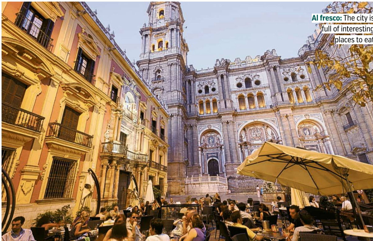
Al fresco: The city is full of interesting places to eat

By day three, I'm on a devoted culinary mission. If you're a food-lover seeking new thrills, head to the sandy seaside, where you will find the local barbecuing ritual, 'espeto'. I watch vendors – old men who have done it for years – gently grill fresh sardines on an open fire built from olive wood. Although I'm told that discerning seafood eaters should wander another kilometre east to Pedregalejo, a fishing village of