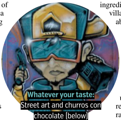
Whatever your taste: Street art and churros con chocolate (below)

She tells me that the local Ibérico pigs from Ronda, a city west of Málaga, feed on chestnuts instead of acorns, resulting in a meat to rival the famous ham from the town of Jabugo. 'The